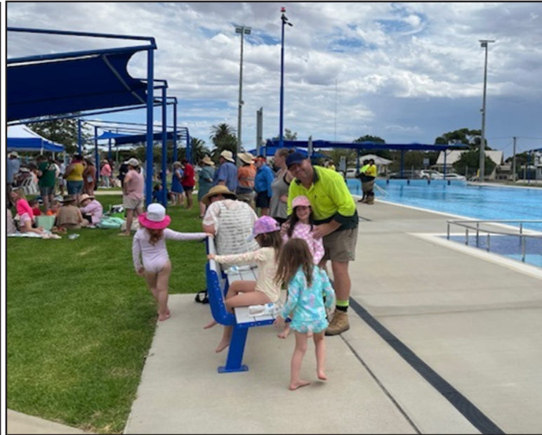
Members of the community enjoying the opening of the pool